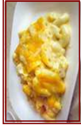
Mac & Cheese