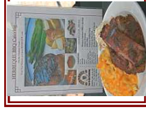
Baby Back Ribs Dinner