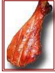
Smoked Turkey Leg