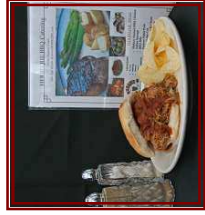
Famous Pulled Pork

Office: 772-344-3753 · Fax: 772-336-9976 · Email: Herbert@HERBEQUE.com